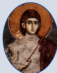
History of the Wars (545-553) Procopius of Caesarea