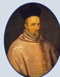
Histories of Scotland (1578) John Leslie